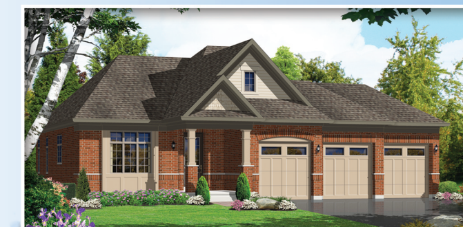
Bungalow Elev-B - 1202 sq.ft.