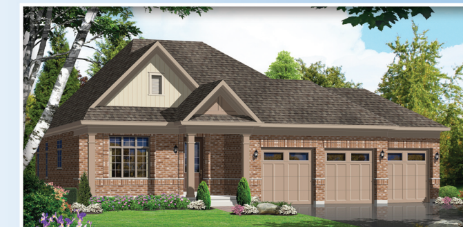
Bungalow Elev-A - 1202 sq.ft.